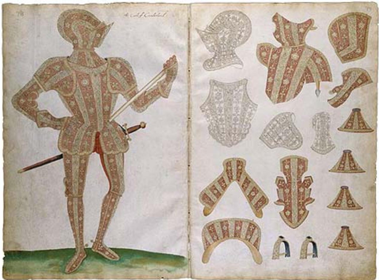
Design for armour for the Earl of Cumberland, 1586–90 (V&A: D.605–1894)