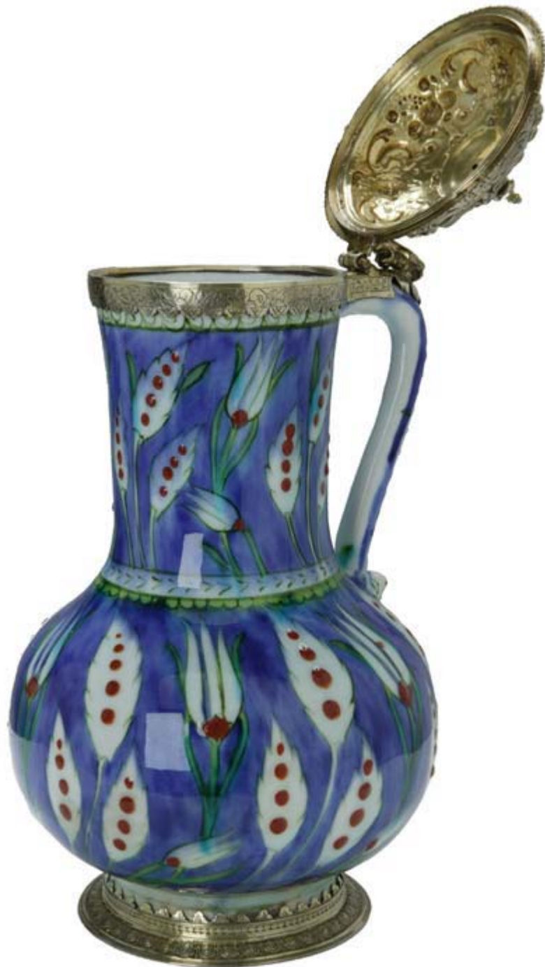
Drinking pot, c.1580 (V&A: 1561-1904)