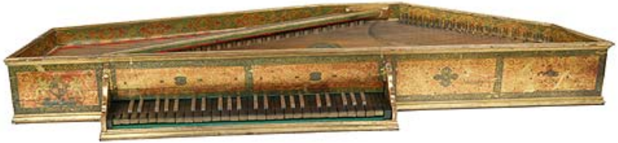
Elizabethan spinet, 1570-80 (V&A: 19-1887)