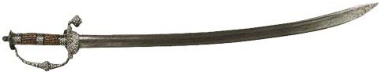
Sword blade, 16th century (V&A: M.2788-1931)