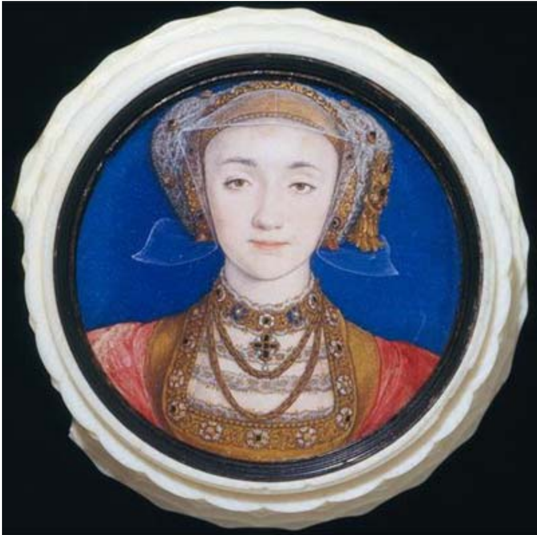
Miniature portrait of Anne of Cleves by Hans Holbein, c.1539 (V&A: P.153-1910)

Anne of Cleves: portrait, plan for Henry and Anne to meet, writing frame